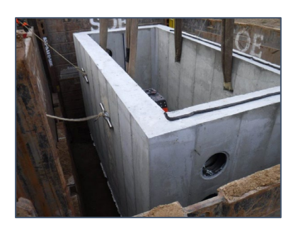
Instalación de bóveda

Las cuadrillas establecerán un ambiente con clima controlado en cada ubicación de la bóveda para unir los cables subterráneos. Esta actividad es continua durante aproximadamente una semana para cada bóveda.