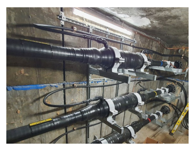
Empalme de cables